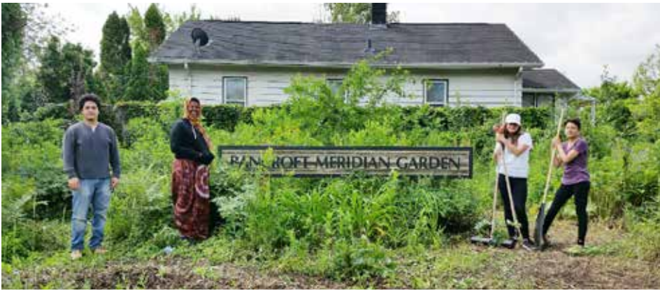
The STEP-UP interns working hard in the Meridian Garden.