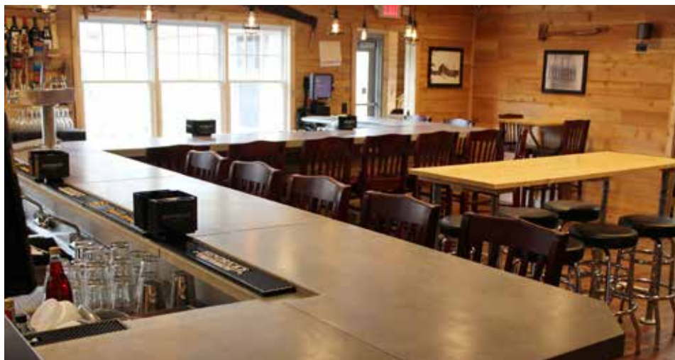
Commercial counter top design by Miele Concrete + Design.