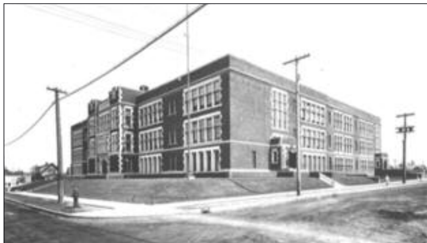
Bancroft School soon after its construction in 1912.

Like many neighborhoods, the Bancroft neighborhood is named after our school, Bancroft Elementary. Here are a few interesting facts about our neighborhood school: