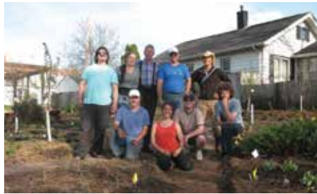
Volunteers planted fruit trees last year at the Meridian Garden.

If you'd like to get involved, or have ideas that could help the Green Initiatives Committee reach our goals for the garden, please let us know. Additionally, we have scheduled two work days each month (one week night and one weekend day) for volunteers to come out, learn about the garden, and help out. Check the calendar for specific dates and times.