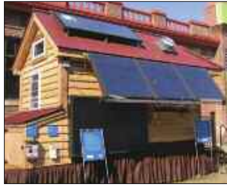
The tiny solar house will be on display during the South Minneapolis Housing Fair.

New this year is a booth from Tech Dump, where you can bring your small electronic devices for recycling, and a booth on solar gardens by