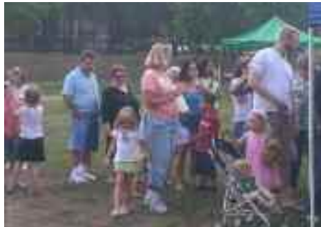
Neighbors line up for refreshments at BNA's popular Ice Cream Social, held in the summer at Bancroft Meadows.

This committee's goals are to increase diverse participation of community residents with the neighborhood organization and promote BNA activities and functions. If you want to create community building events and improve the communication of our neighbors, this committee is for you. Check our calendar for monthly meeting times and locations.