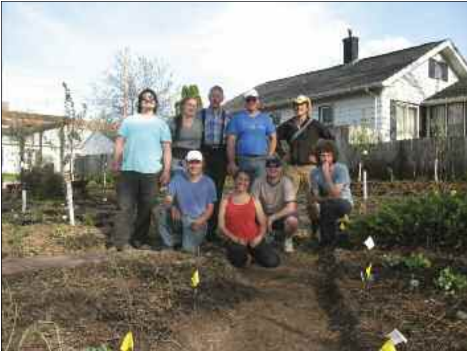
Bancroft residents and other volunteers at the Meridian Garden after a full weekend of clearing and planting.

A Newsletter for the Bancroft Neighborhood