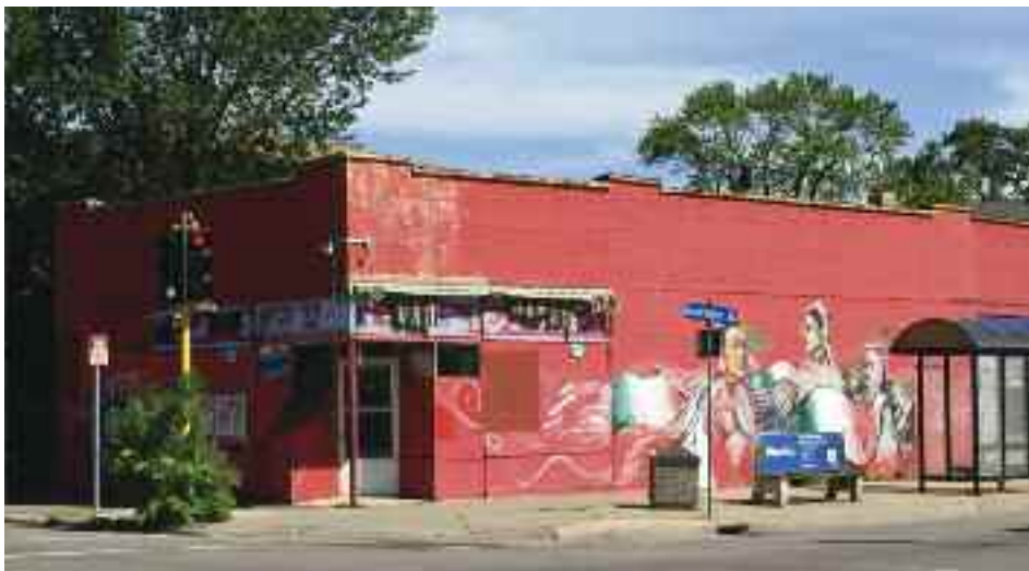
This building at 38th and Bloomington is scheduled to be demolished this summer due to structural and safety issues.