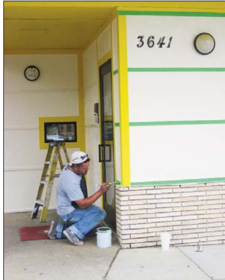
Sunshine Tree Child Development Center at 3641 Chicago Ave gets a paint-job!