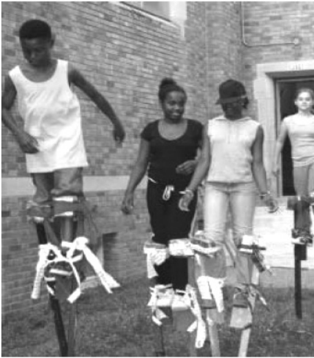
Stilting Class, Summer 2006